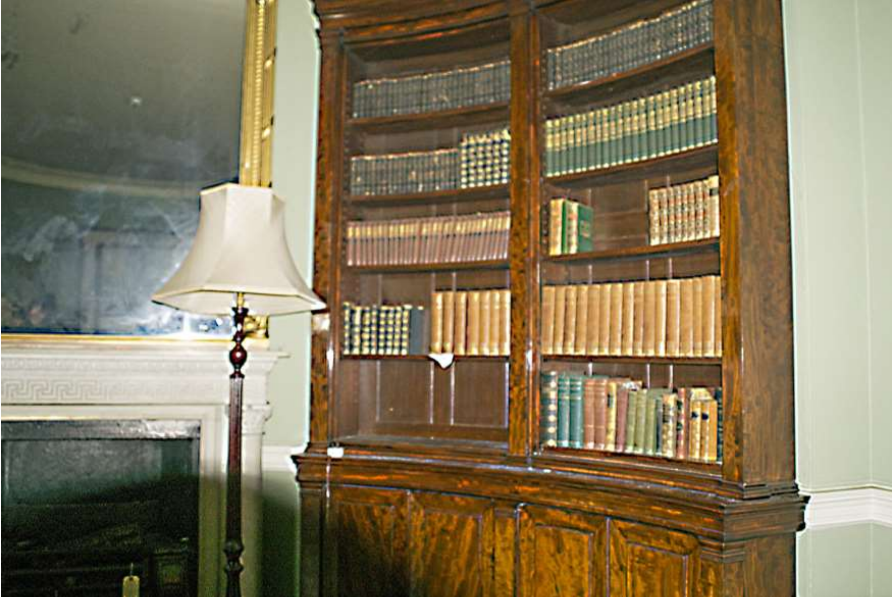
The curved bookshelf