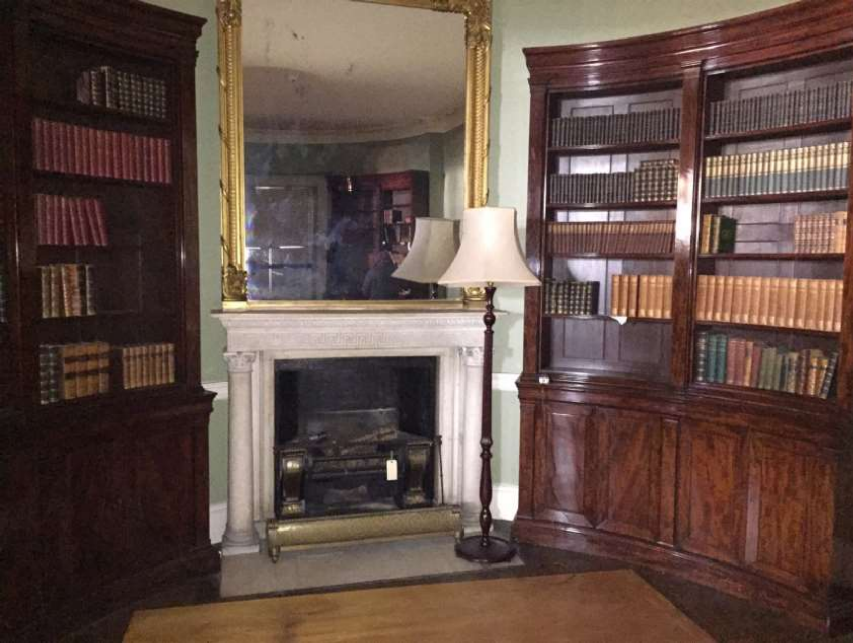
The library with its curved bookshelves, built to fit the curvature of the walls.