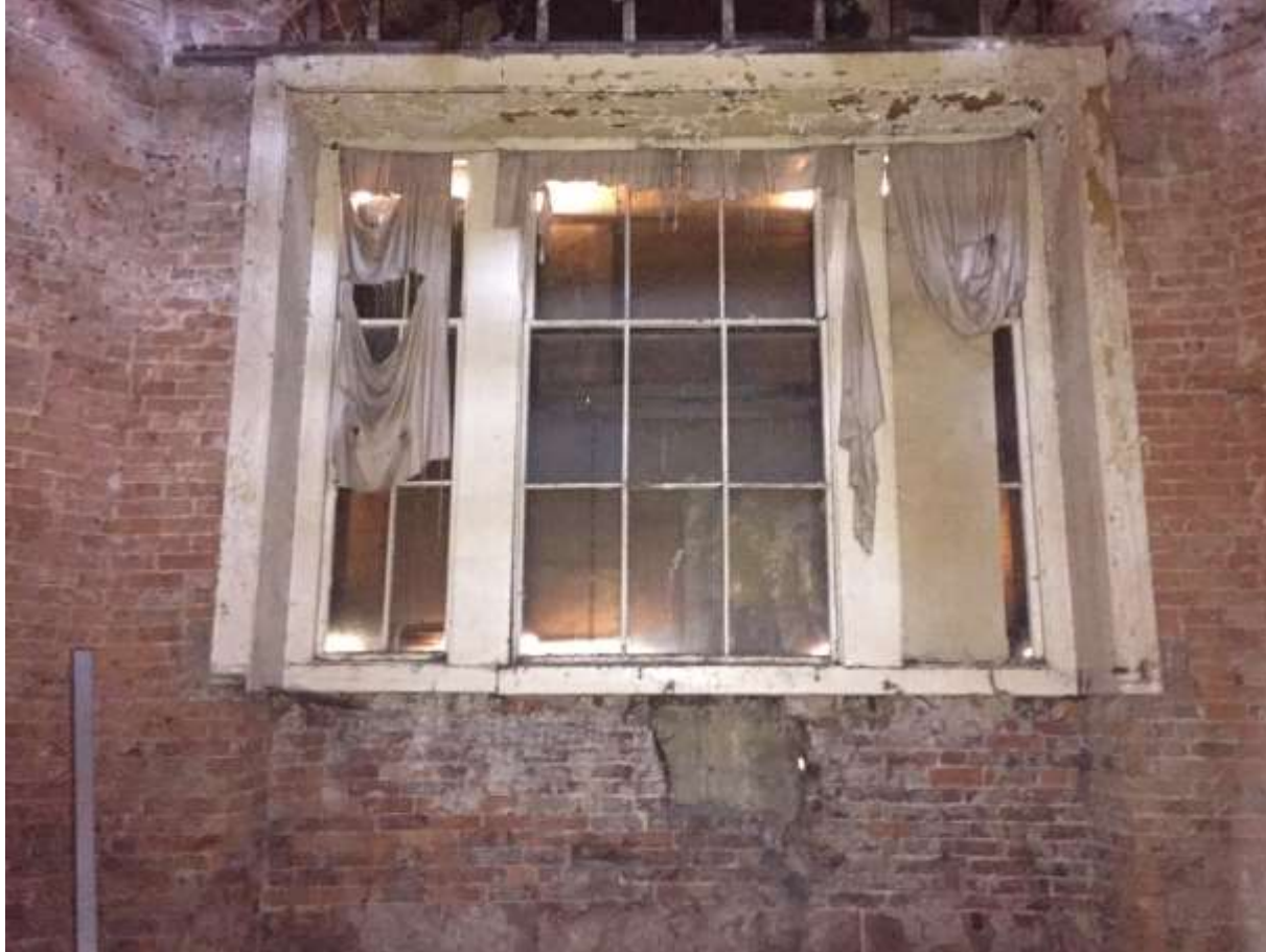
The kitchen window (in the damaged West Wing)