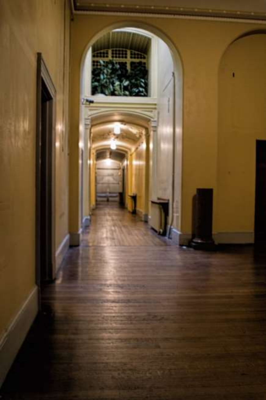
The long corridor to the library