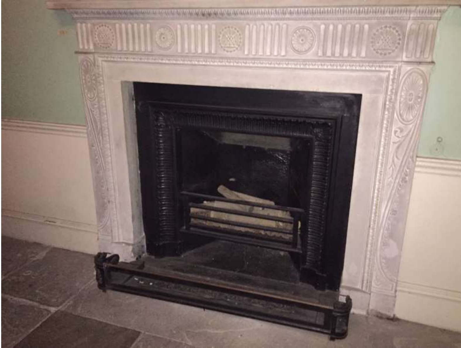
The fireplace in the entrance hall. It had a stone floor as it was used as the estate office