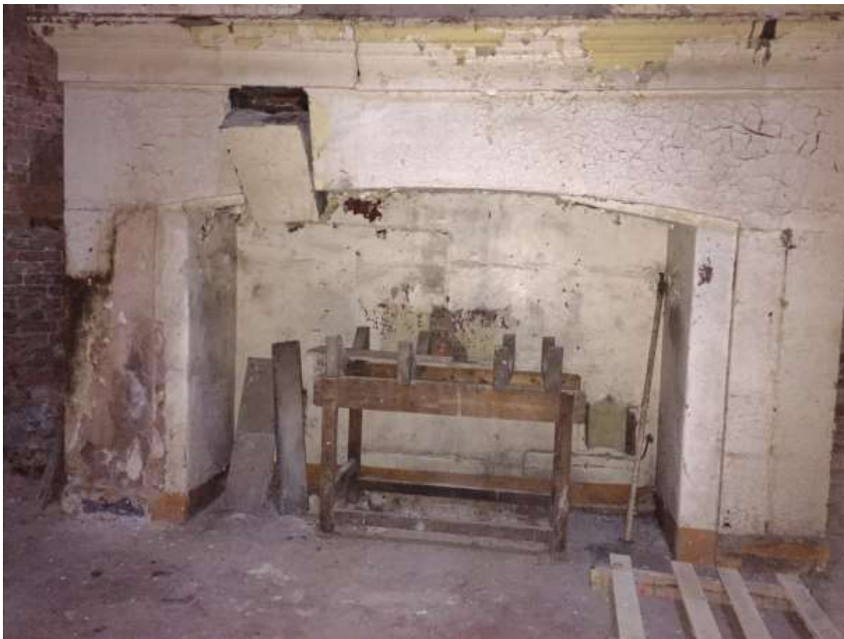
One of two giant fireplaces in the kitchen (in the damaged West Wing)