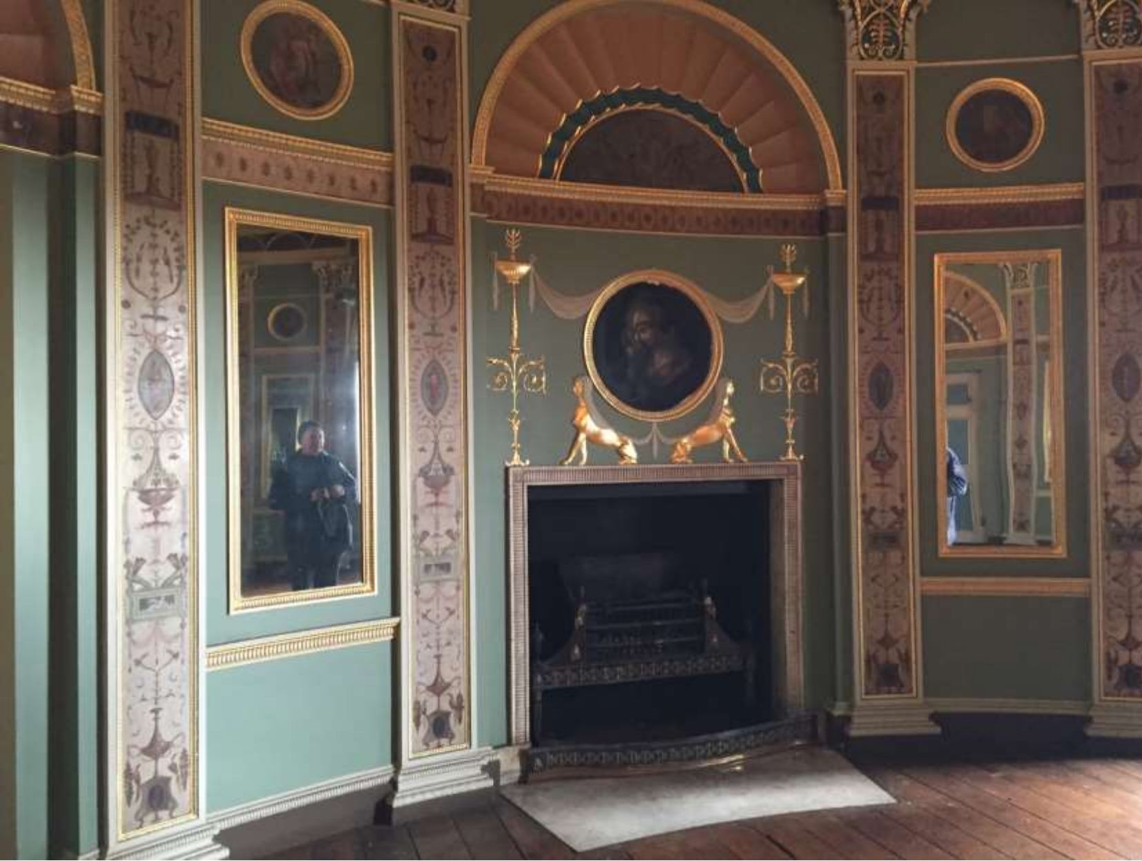
The round Cupola Room, the grandest room in the building. It was made for her mother as a room in which she could relax. Her bedroom was adjacent to this.