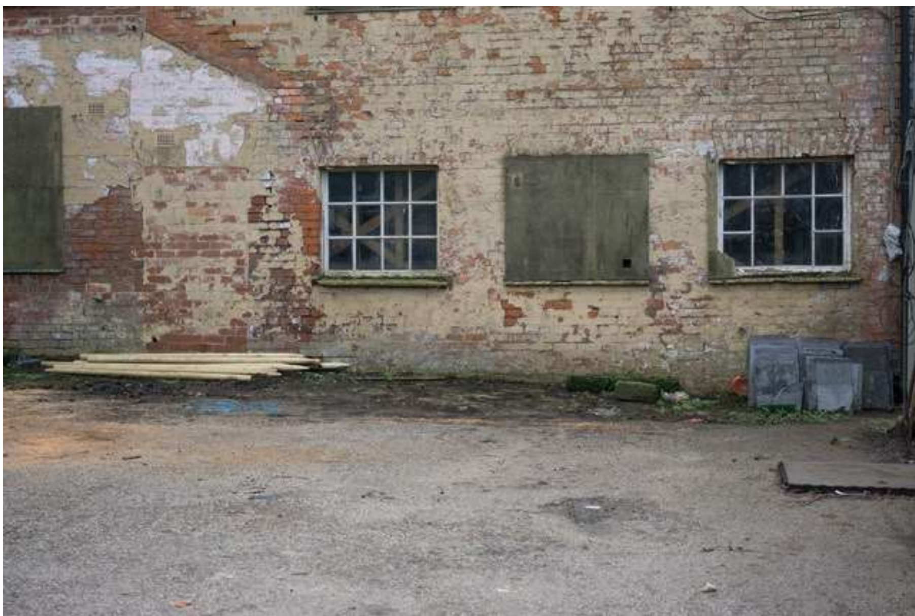
The courtyard was later used to entertain groups such as cubs