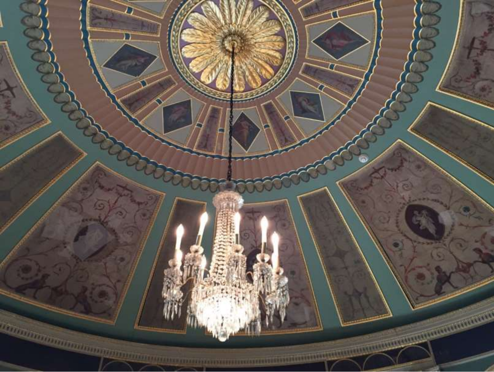
The domed ceiling of the Cupola Room.