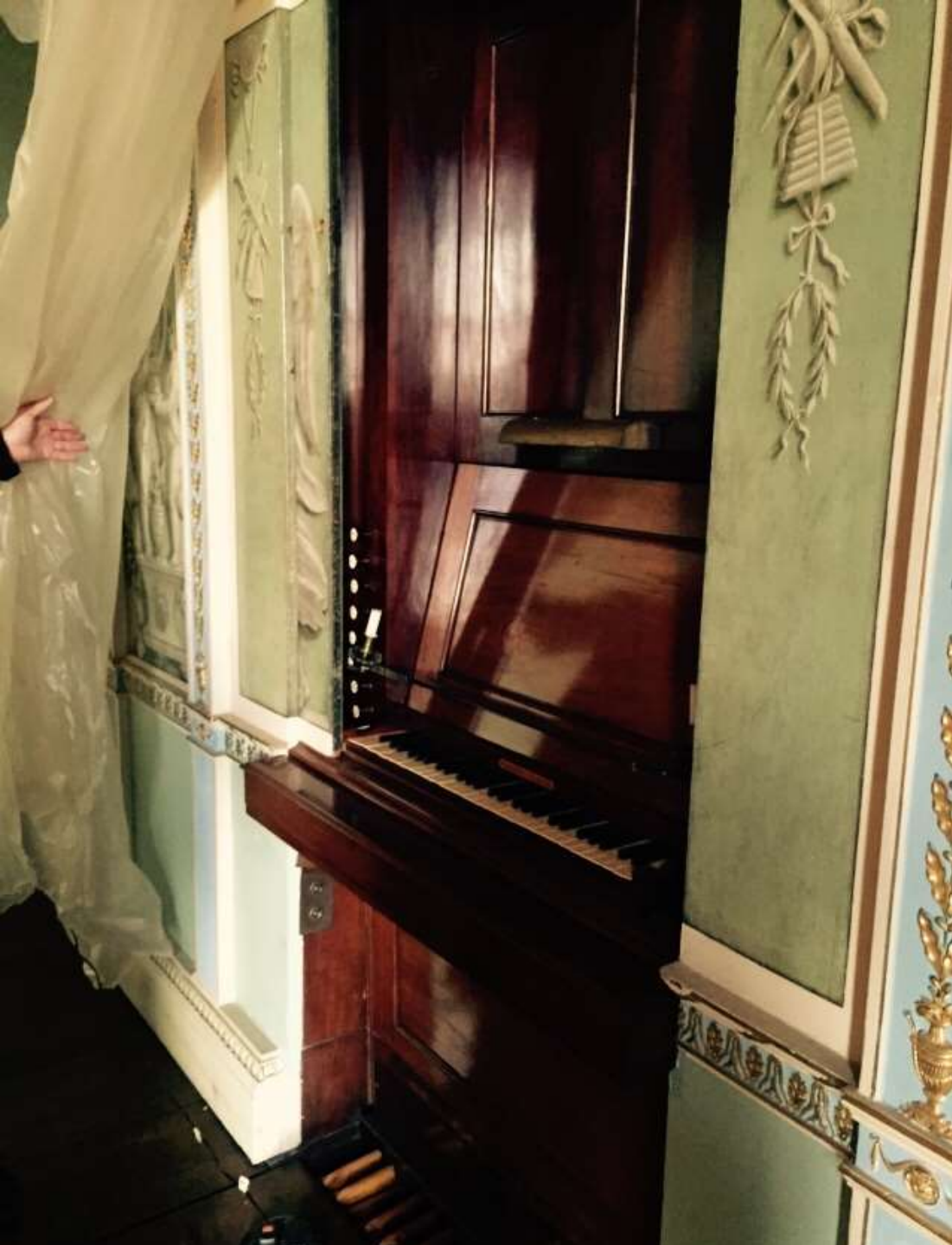
The Samuel Green organ, similar to the one in Winsor Castle