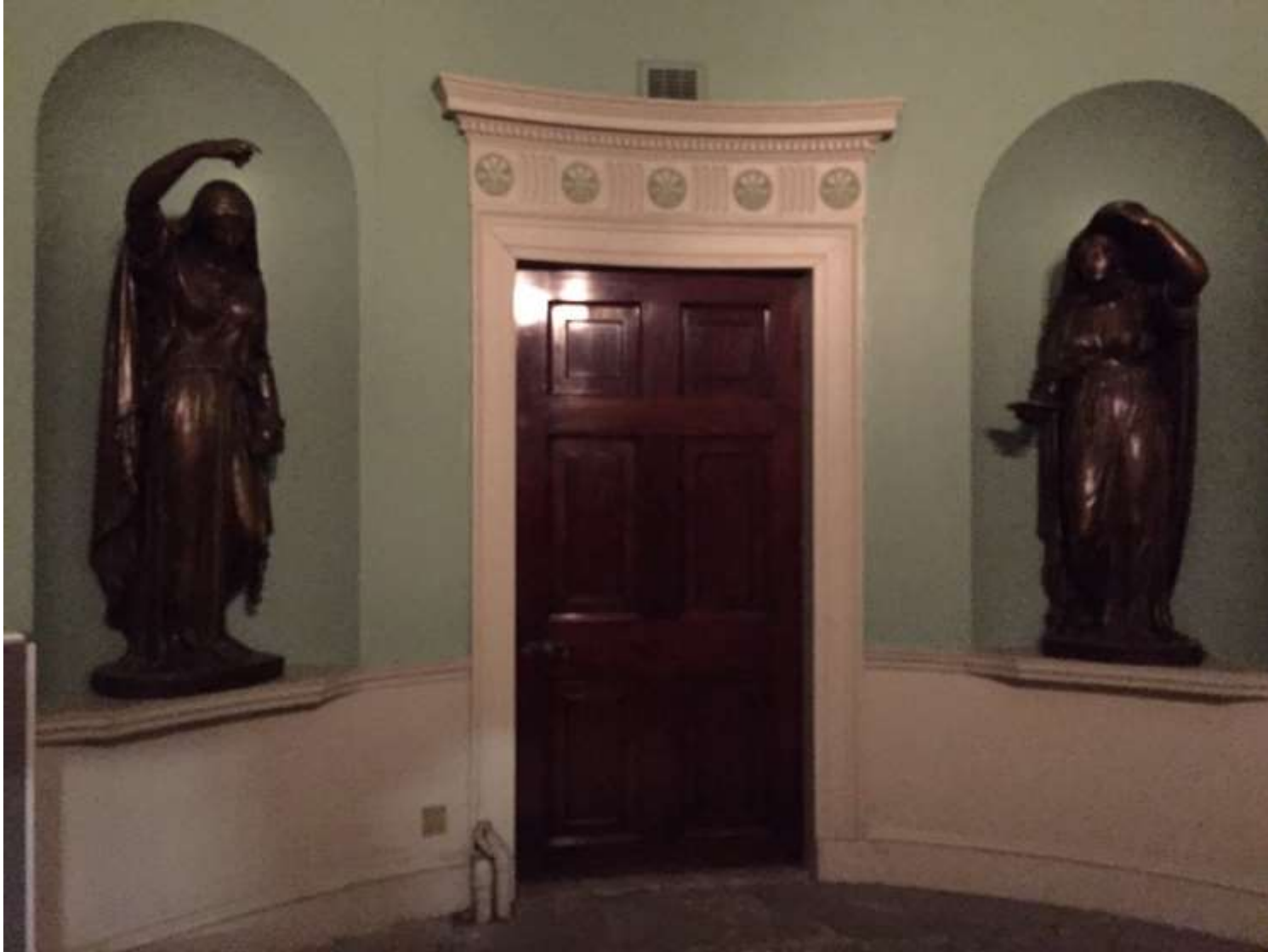
This is part of the entrance to the hall