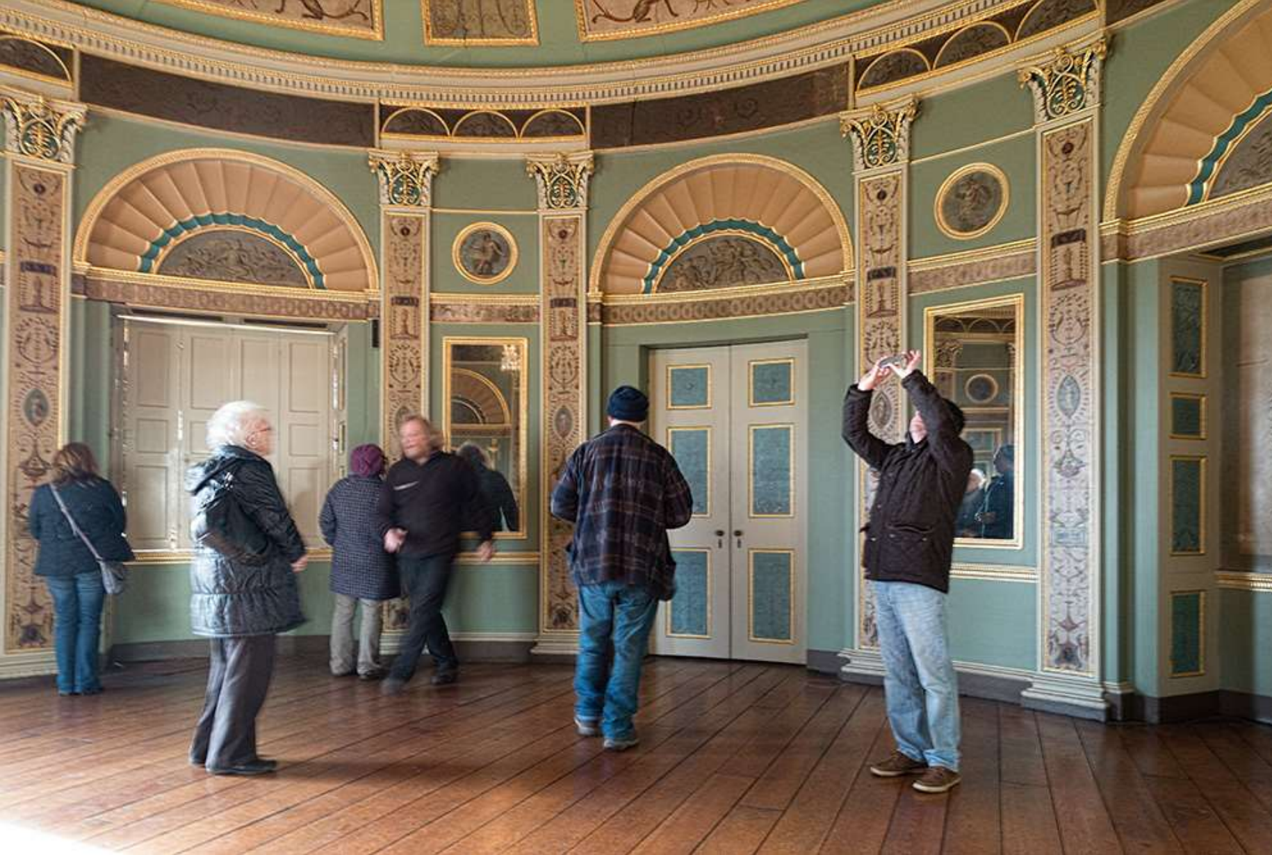
The group in the Cupola Room