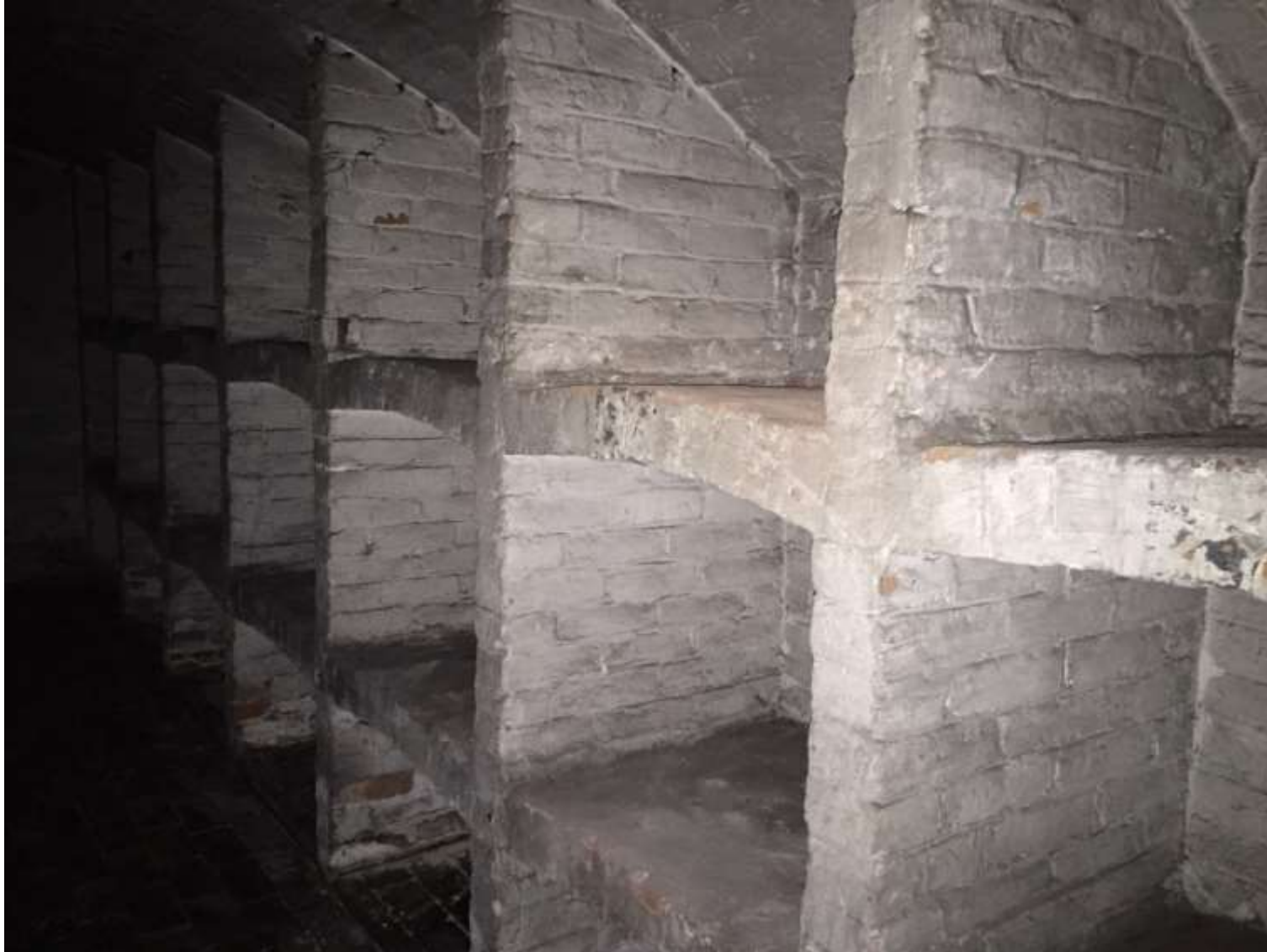
The arched storage areas in the cellar