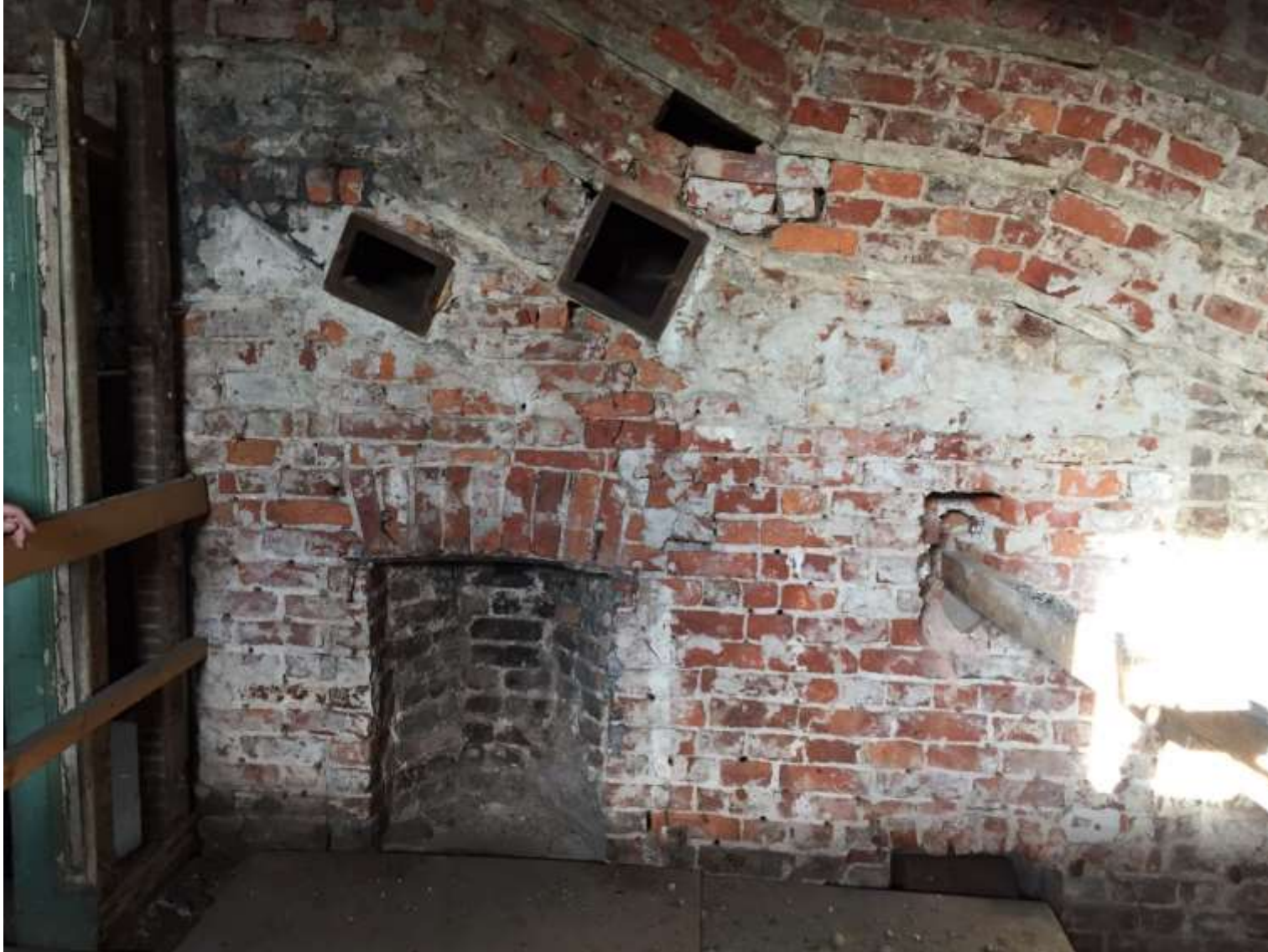
The servants bedrooms (in the damaged West Wing)