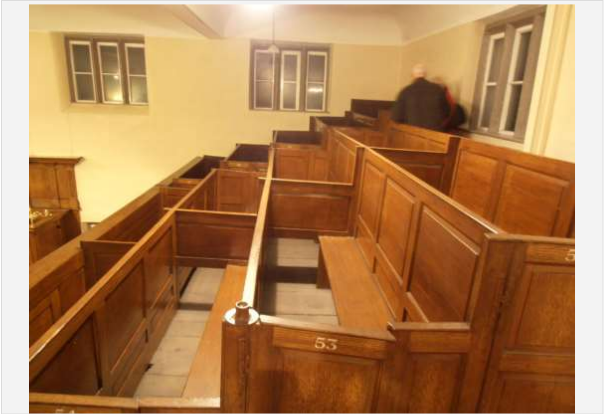
box pews on balcony