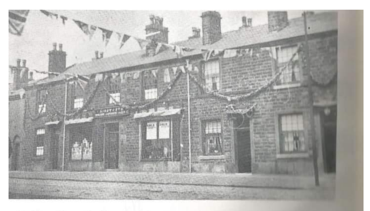
1911. Church Street decorated for the Coronation of King George V.