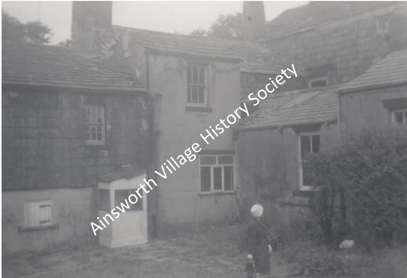
The back of the house Circa 1965