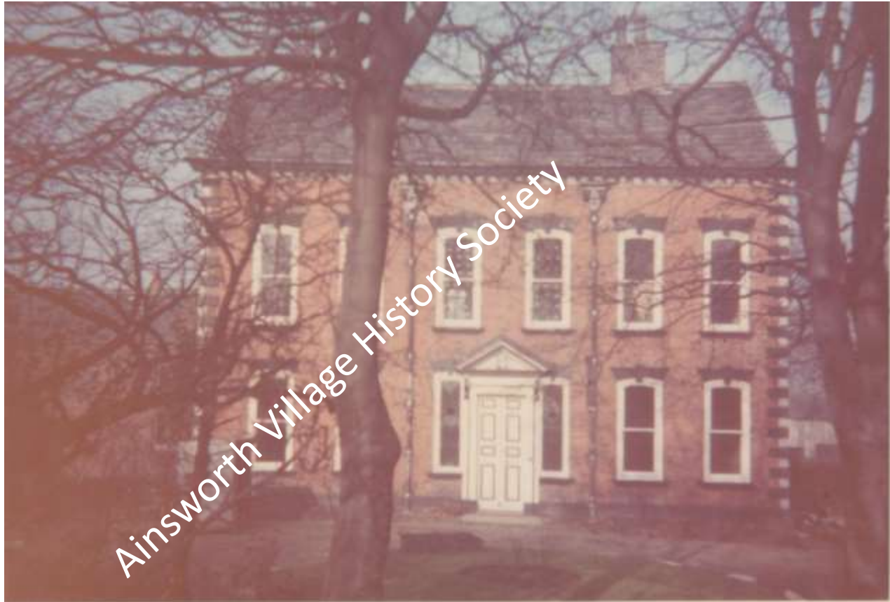
The front of the house Circa 1965