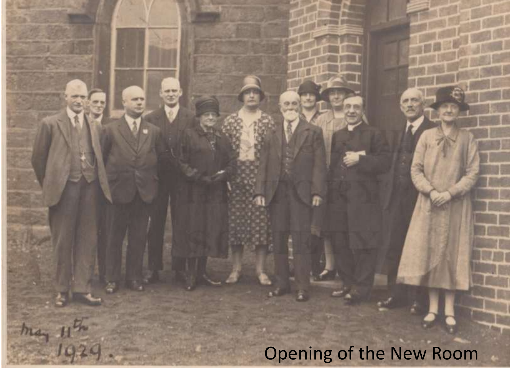
Opening of the New Room