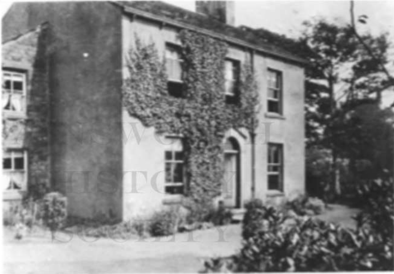
Ainsworth Vicarage in 1905