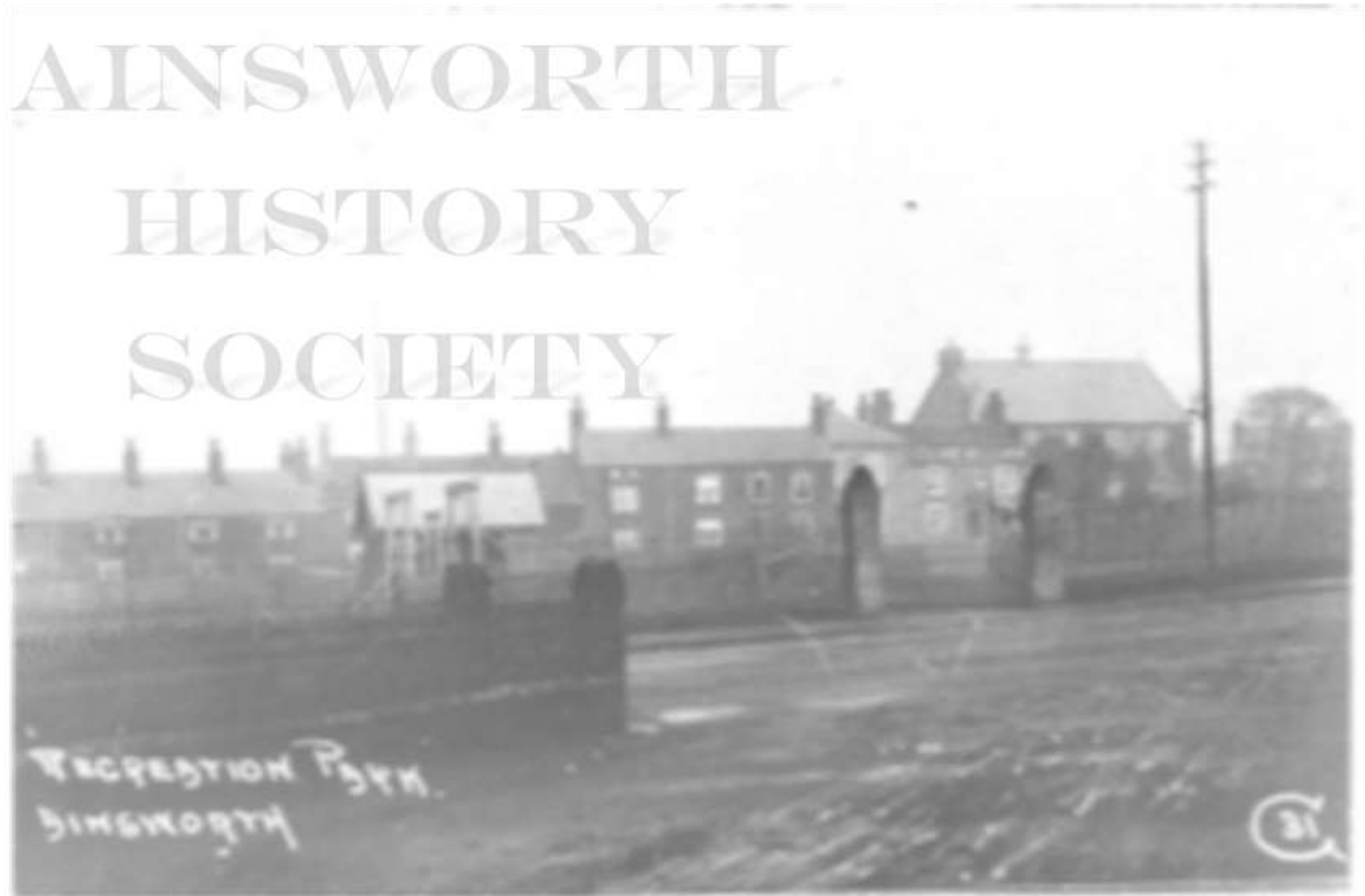
RECREATION PARK AINSWORTH