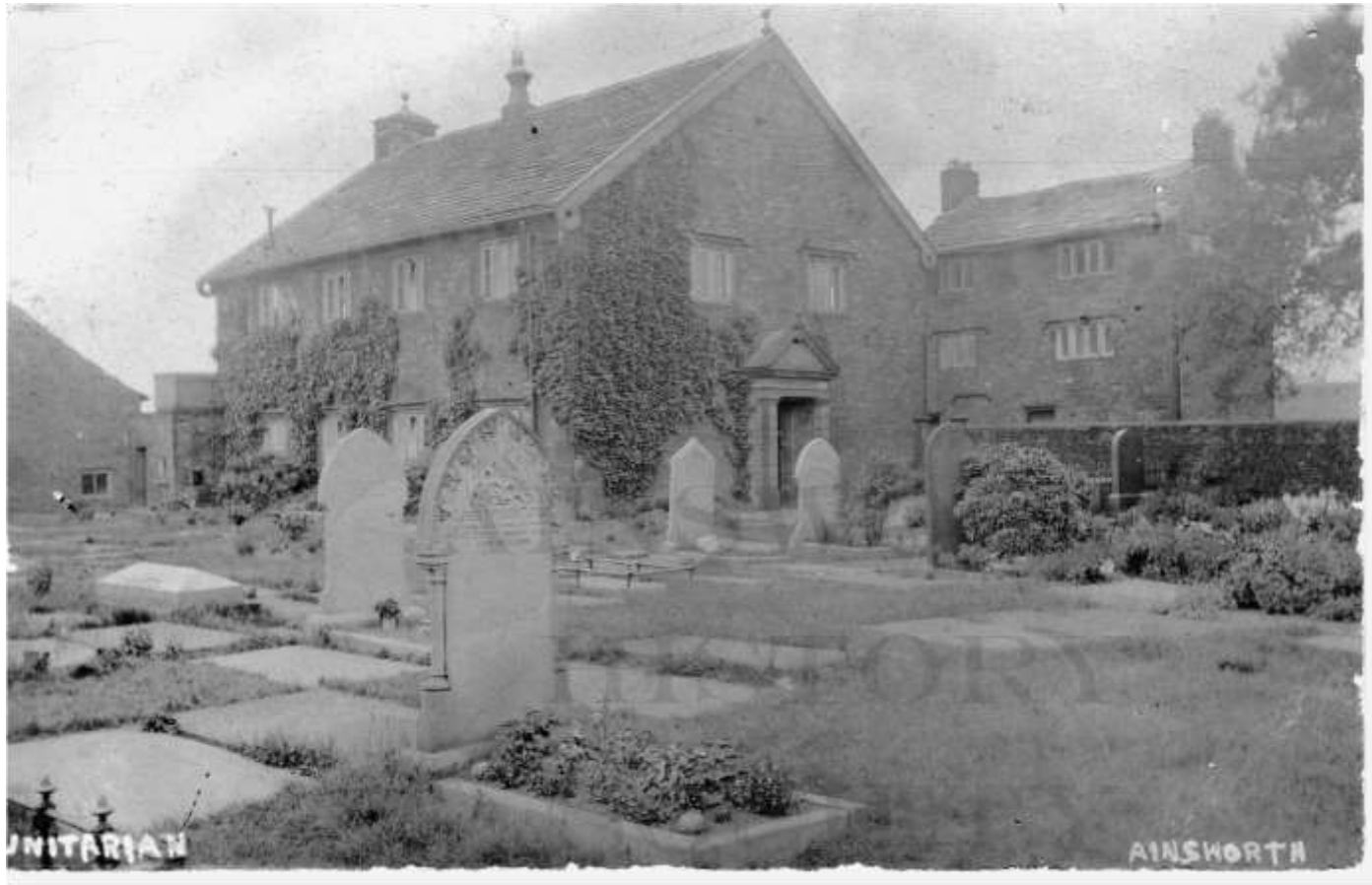
Unitarian Church 1900